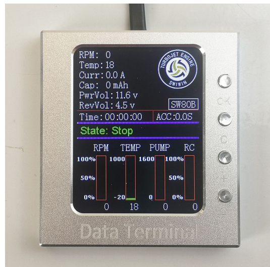
32 bit full digital ECU/Telemetry function GSU startup function