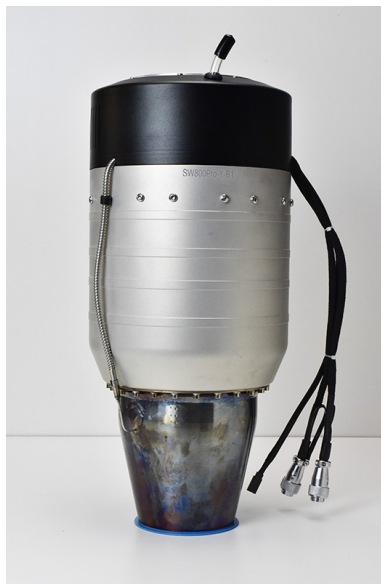
Vertical installation startup function