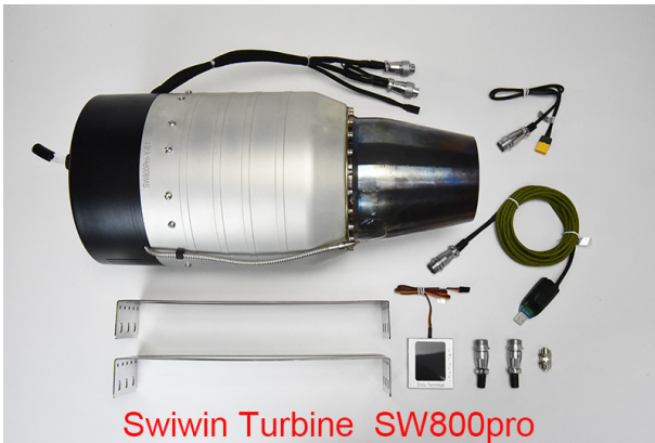
Swiwin Turbine SW800pro