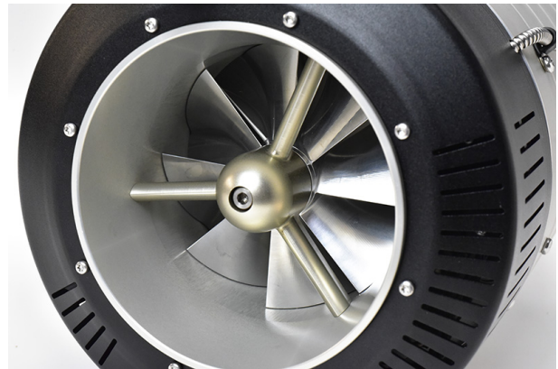
The starter has the functions of starting and generating electricity